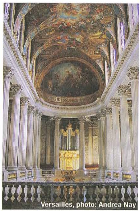
Versailles