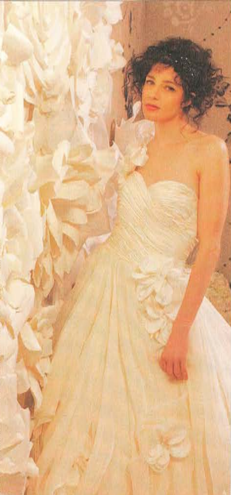
Silk taffeta bodice featuring handmade taffeta flowers along skirt and strap. $7,950 rminebridal.com